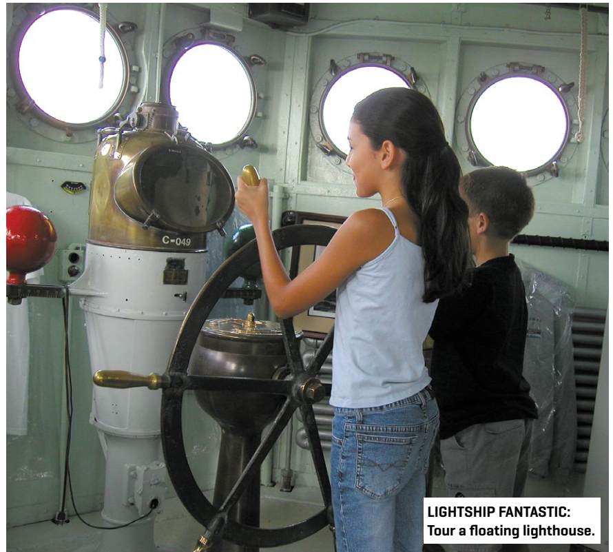
LIGHTSHIP FANTASTIC: Tour a floating lighthouse.

A 40-minute drive from Lewes may seem far, but Dover Air Force Base's unusual Air Mobility Command Museum is worth