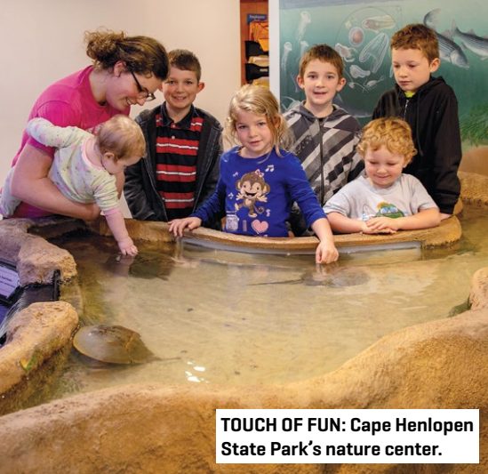
TOUCH OF FUN: Cape Henlopen State Park's nature center.

crabs and shorebirds. Inside the educational facility are interactive exhibits about the Delaware Bay's natural history and ecology plus tanks with live horseshoe crabs and terrapins. An osprey cam is trained on a nearby nest, and with another nature cam that can be directed remotely with a joy stick, you can zoom in on some of the other 130 species inhabiting pretty Mispillion Harbor. Free. 2992 Lighthouse Rd., Milford; 302-422-1329.