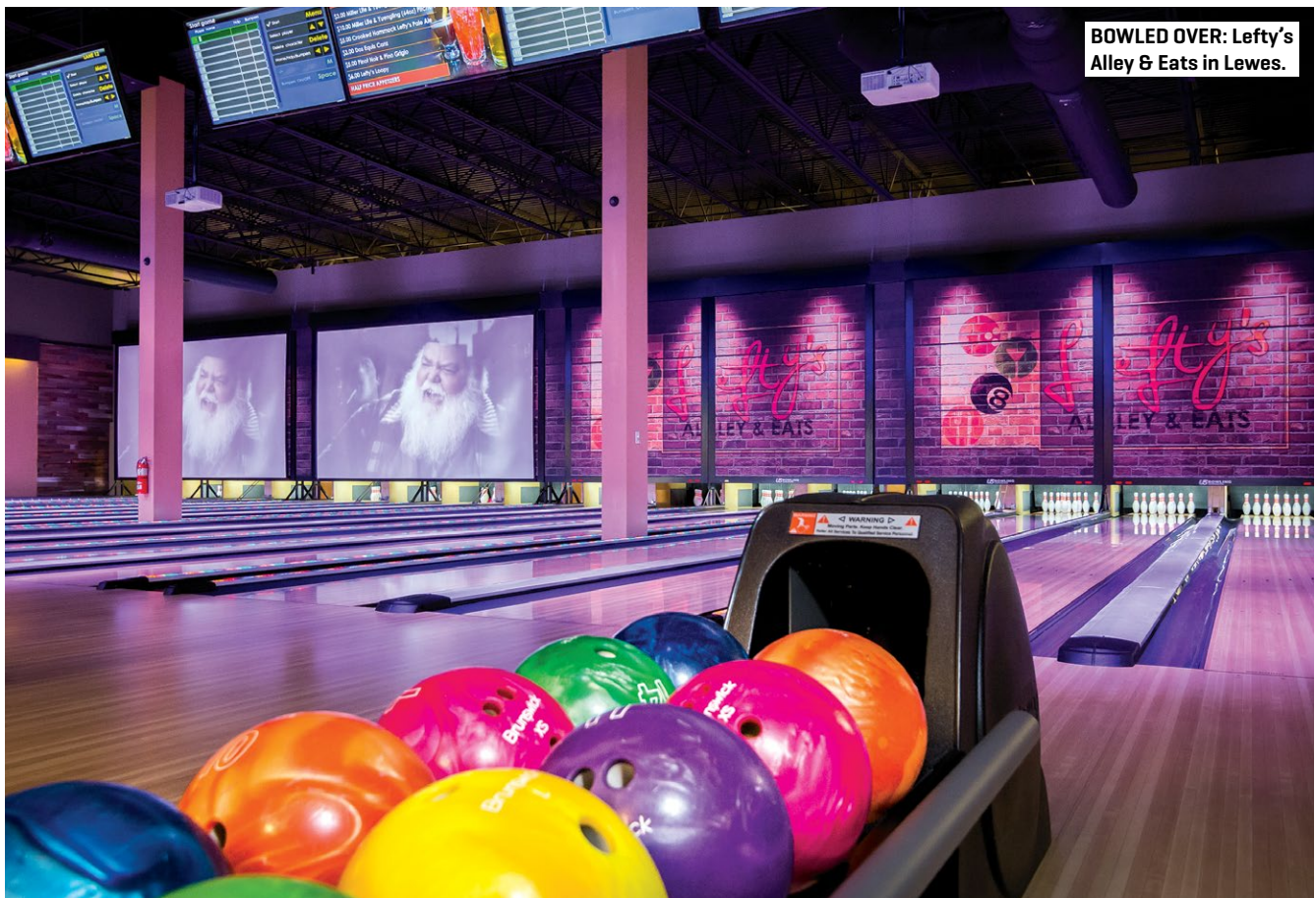
BOWLED OVER: Lefty's Alley & Eats in Lewes.