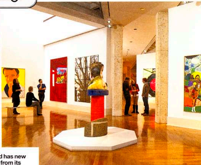
Richmond has new energy, from its restaurant scene to the renovated Virginia Museum of Fine Arts.